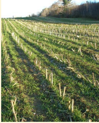
A cover crop grows in no-till corn residue on a Maine farm.